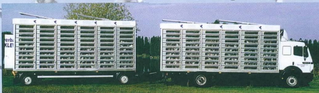
Combination for app. 7.300 pigeons