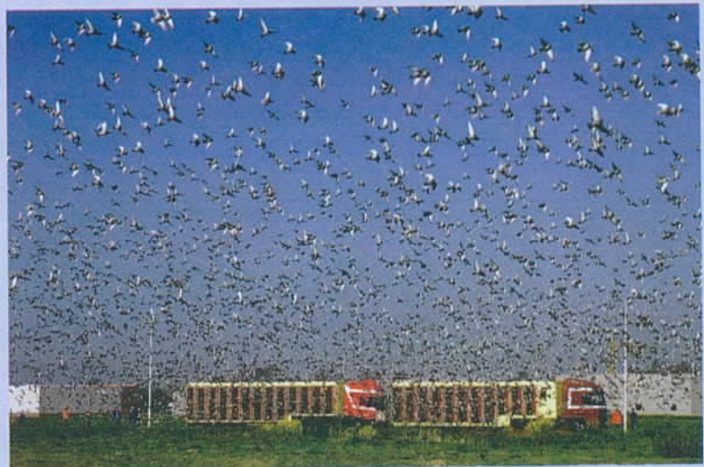
Special solutions for every requirement