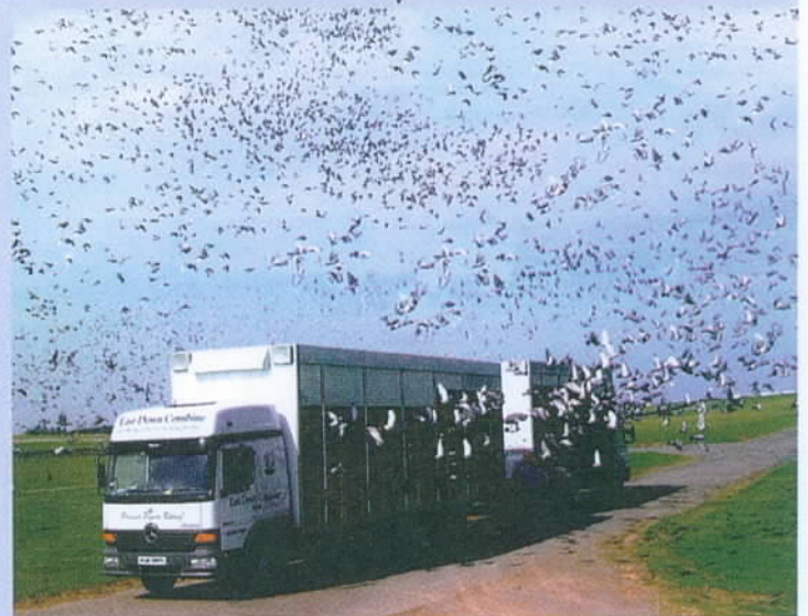
2 transporters for app. 10.000 pigeons in action