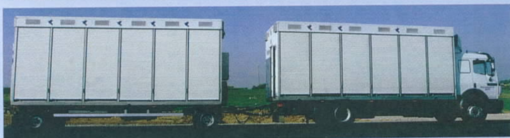
Combination for app. 7.300 pigeons consisting of truck for app. 3.500 pigeons and trailer for app. 3.800 pigeons