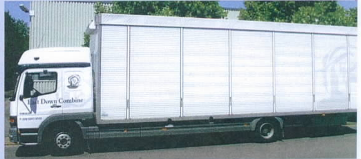
Transporters for app. 5.000 pigeons

Most modern air-ventilation system, the optimum in water supply and the best travel-comfort for your pigeon is standard for us. The pigeon arrives at the place of liberation in the same condition as it leaves the loft. Our fully developed system is the best solution for proper transport of your pigeons worldwide.