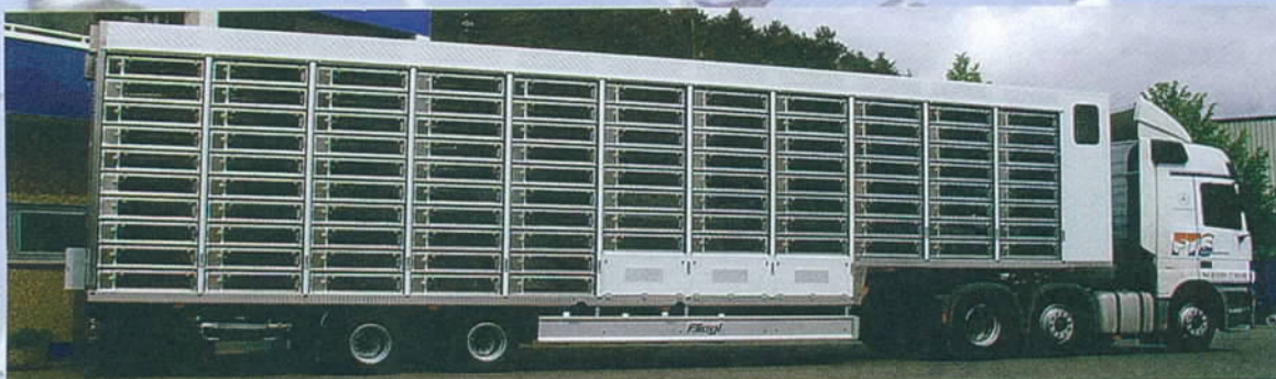
Articulated trailer for app. 6.000 pigeons