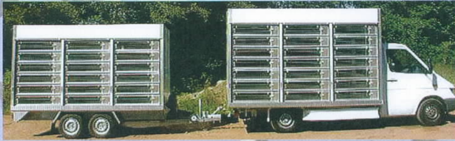
Combination Truck and Trailer for app. 2.400 pigeons