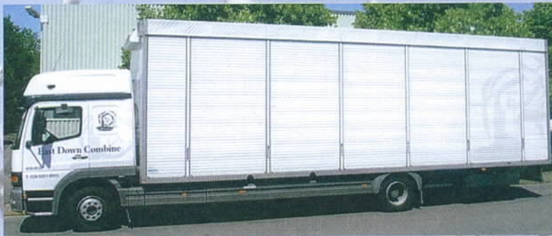
Transporter for app. 5000 pigeons