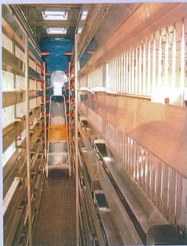
Most modern supply for the pigeons