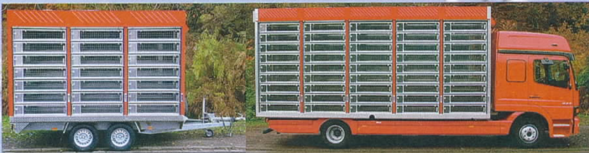
Combination for app. 4.400 pigeons