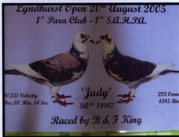
2 Sides of Judy SA04 14987 winner of Lyndhurst Open

Brian... We would like to see more flyers in the sport. Years ago the children of families stayed home and were more involved with what their parents were doing, but these days with easy access to cars the kids are off and doing other things.