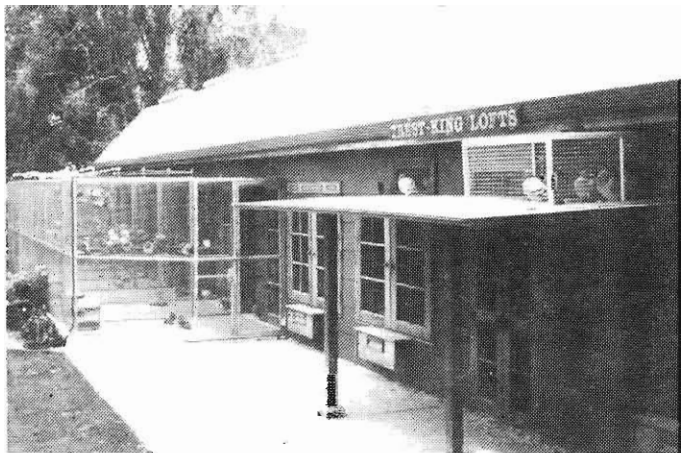
Close up view of Ross Hocking's Pigeon Palace

The birds which have not been flown a full season at Broadview as yet are based on the best that could be bought at Allen Goodger's sale and at Keith Wickham's sale, also Stef Orfanos' pigeons were crossed into the Goodgers with excellent