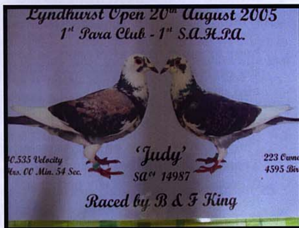
2 Sides of Judy SA04 14987 winner of Lyndhurst Open

Brian... We would like to see more flyers in the sport. Years ago the children of families stayed home and were more involved with what their parents were doing, but these days with easy access to cars the kids are off and doing other things.