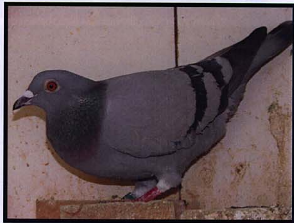
Coleambally Winner SA04 24103 BBH

Eddie... No particular feed, I make up a mixture of various Grains and Seeds, usually consisting of about 50 percent Peas, as the season progresses I add a little extra Corn and I do not change much, but I like to add a little extra small seed after a race, I do not give any Peas in the first hour after a race.